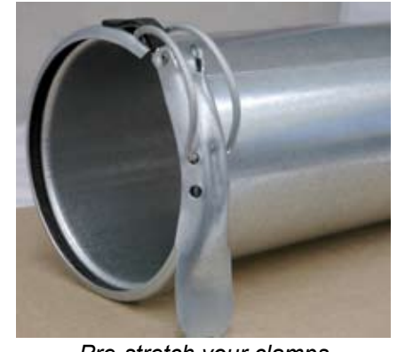
Pre-stretch your clamps

STEP SEVEN: Pre-Stretch Your Clamps. The Nordfab clamps are designed to provide a tight seal, which means that they also require some pressure to close. By pre-stretching the clamp around the rolled edge of a single piece of pipe, you can make it much easier to close when you connect two pieces together.