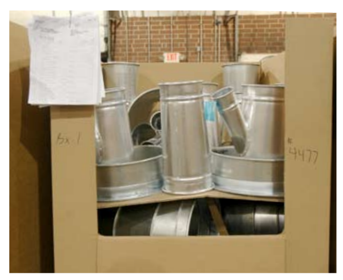
Make sure your parts match the packing list

If you have any problems, call your dealer as he is in the best position to rectify any problems with your particular order. Have all packing documentation with you when you call.