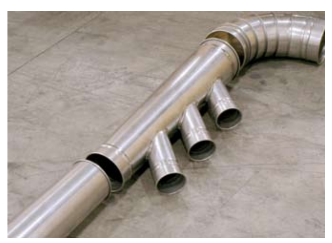
Lay your system out on the floor

STEP THREE: Preparing to Install Your Ducting. It is important for the installer to understand the layout the system designer planned for the ducting. Follow all local codes and regulations and note loading capabilities of structures to ensure the ducting is properly supported and that the building can carry the ducting system. If your installer doesn't understand the layout, he will not to have all the parts necessary to complete the job. If you do not have a clear understanding or drawing of the system you are about to install, please call the person who designed the system before you begin work.