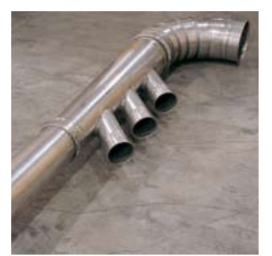
Clamp pieces on ground

The ducting must be properly supported. It is unsafe to have several segments cantilevered without support. Each additional piece of pipe puts enormous amounts of pressure on the clamps and hangers which could result in catastrophic clamp or hanger failure.