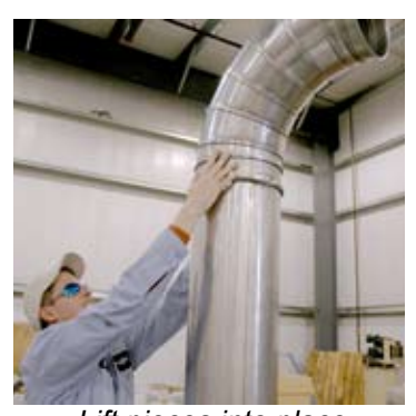
Lift pieces into place