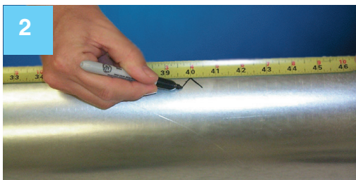
On QF Pipe, mark the distance to be spanned less 4".