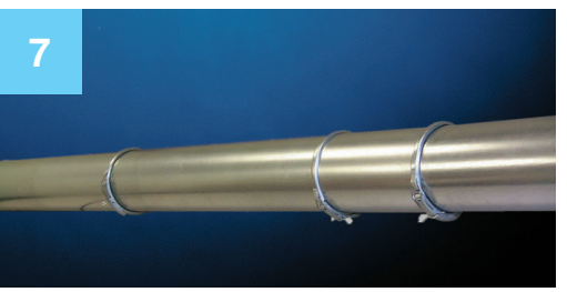
Finished connection with the QF Adjustable Nipple

Note: Keep cut QF Pipe in the same direction as the air flow.