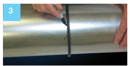
Use provided QF O-ring to mark for cut.